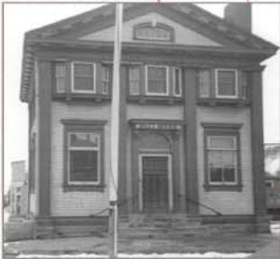
Bank of Commerce