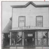
Geary's Drug Store