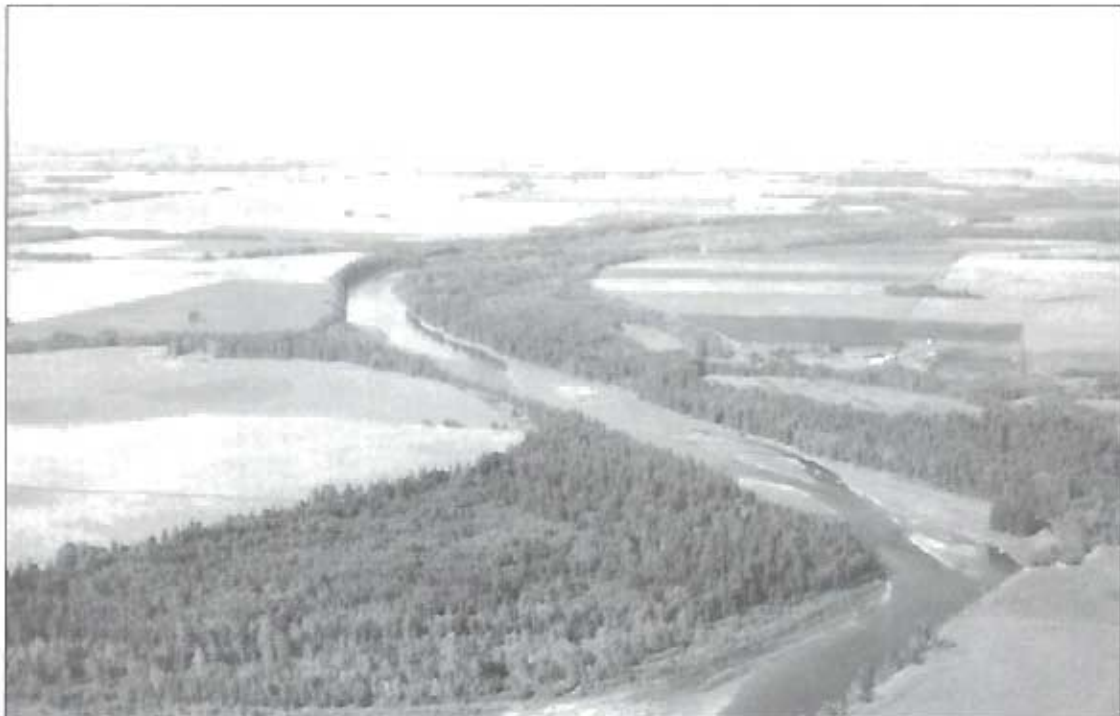
The Red Deer River northwest of Innisfail and the land as surveyed in the 1880's

Other early visitors were the men of the Palliser Survey Expedition. These Palliser crews measured Western Canada's systems of land sections and road grids. In their journals, the Palliser men observed that the Innisfail area was one of the top agricultural sites in Western Canada.