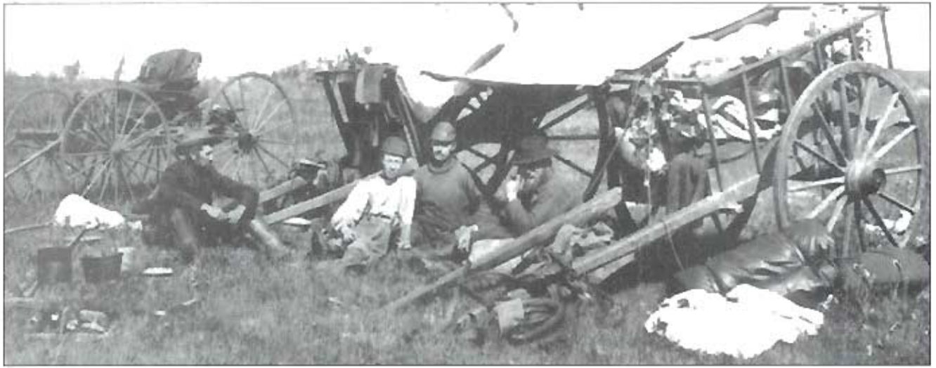
An 1880's Palliser land survey crew

Other early visitors were the men of the Palliser Survey Expedition. These Palliser crews measured Western Canada's systems of land sections and road grids. In their journals, the Palliser men observed that the Innisfail area was one of the top agricultural sites in Western Canada.