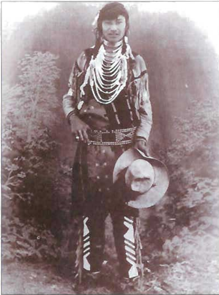
Native portrait

The trade that Henday wished for failed to materialize but Anthony Henday was the first to record viewing the majestic Rocky Mountains. This viewing is believed to have taken place from what is now known as Antler Hill, a location north of Innisfail and the highest point between Calgary and Edmonton.