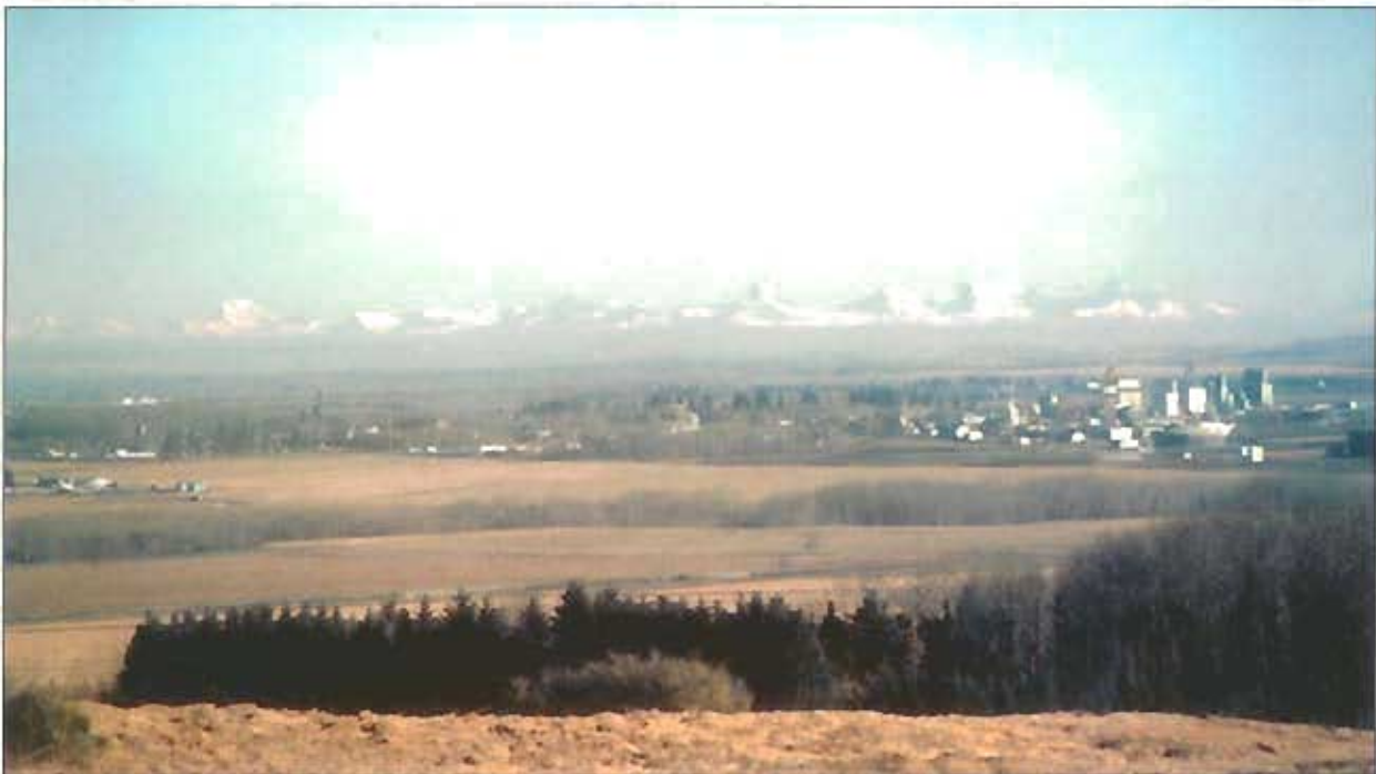
Rocky Mountains as seen from Antler Hill

The trade that Henday wished for failed to materialize but Anthony Henday was the first to record viewing the majestic Rocky Mountains. This viewing is believed to have taken place from what is now known as Antler Hill, a location north of Innisfail and the highest point between Calgary and Edmonton.