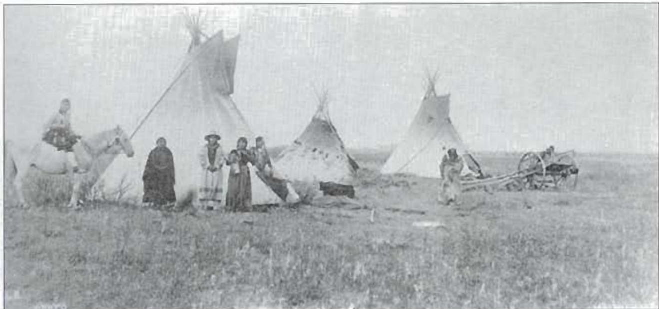
A native camp photographed in the Innisfail area