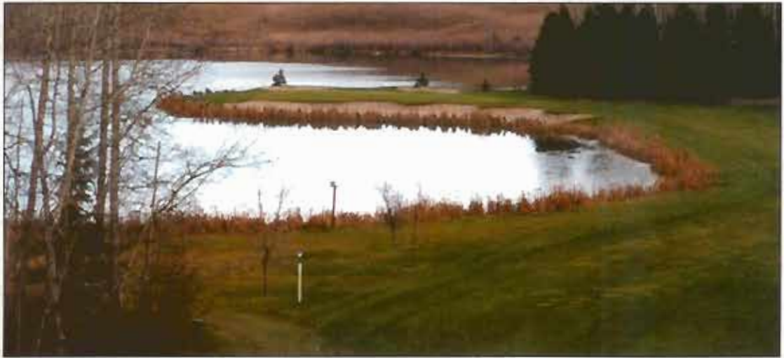
The Innisfail Golf Course