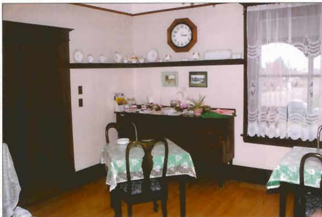
The Dining Room of the Dr. George/Kemp House