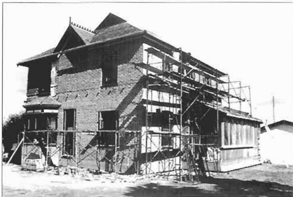
Kemp House reconstruction