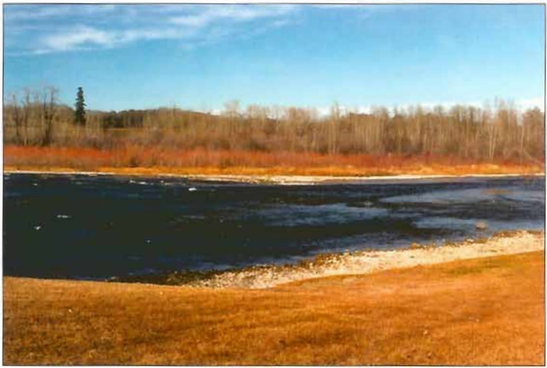
The "Crossing" on the Red Deer River near Ft. Normandeau

During the Northwest Rebellion, as a result of threats to settlers living near the Crossing, Reverend Gaetz and Bill Kemp led a large group to the safety of Fort Calgary. Fort Normandeau had been constructed at the Crossing, however, it was felt Fort Calgary provided more secure protection for the families.