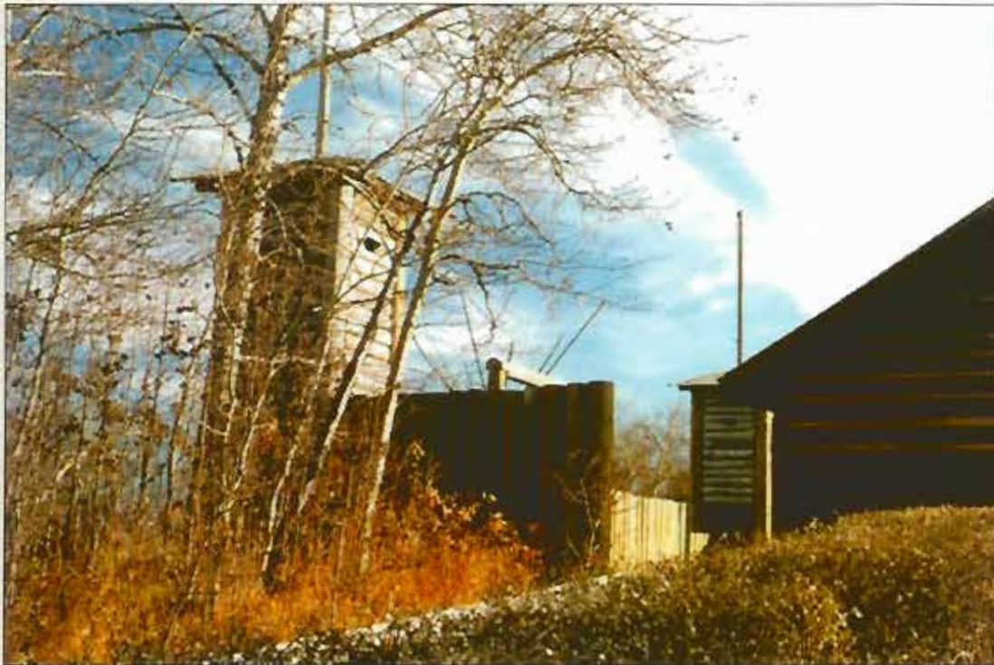
Ft. Normandeau just west of Red Deer

During the Northwest Rebellion, as a result of threats to settlers living near the Crossing, Reverend Gaetz and Bill Kemp led a large group to the safety of Fort Calgary. Fort Normandeau had been constructed at the Crossing, however, it was felt Fort Calgary provided more secure protection for the families.