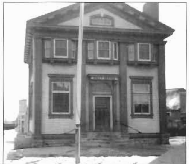
The Bank of Commerce later used as a Post Office