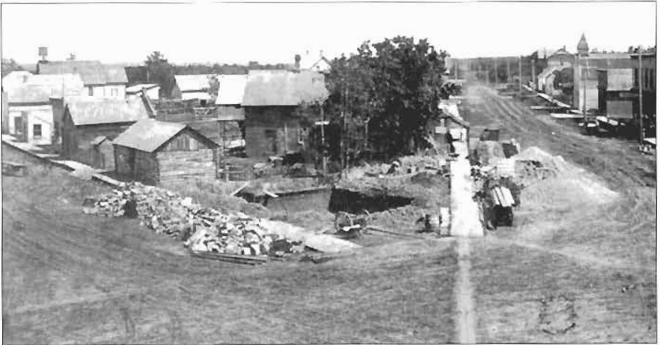
The original construction site of the CIBC