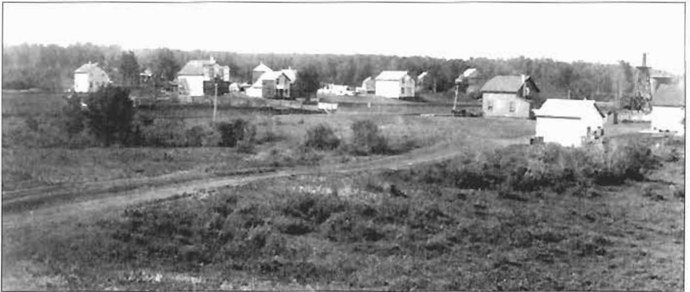
Innisfail in 1892 showing “Constantine’s Stopping House” and the C&E Trail