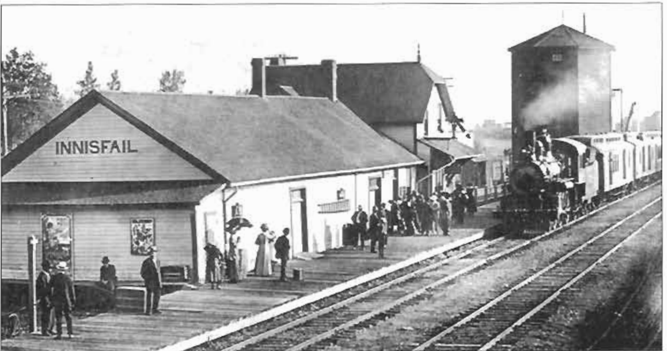
The steam train as it arrived at the Innisfail station in the 1890's