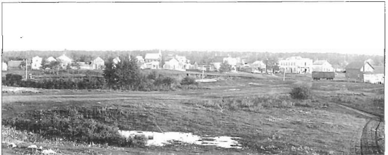
1903 Innisfail as seen from the west