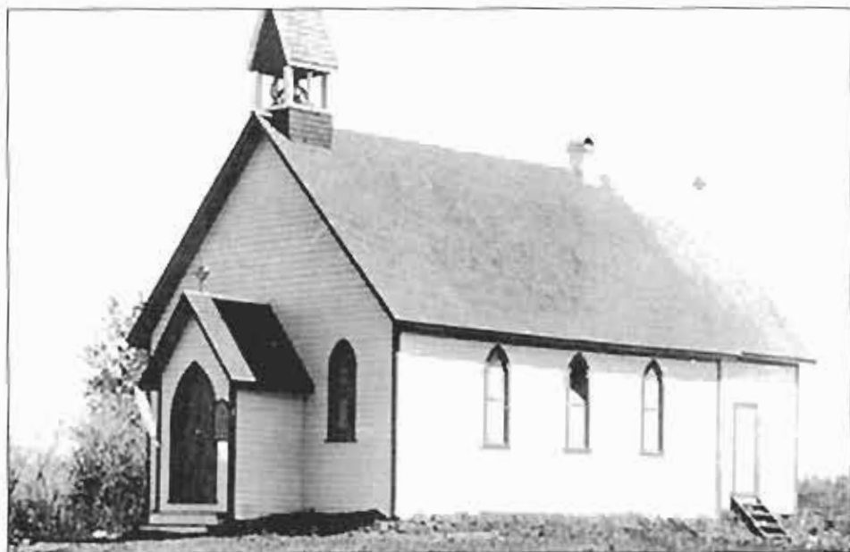
The Innisfail Anglican Church was built in the 1890's