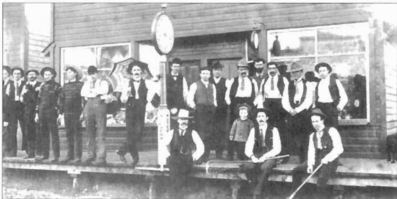
Many of Innisfail's first citizens