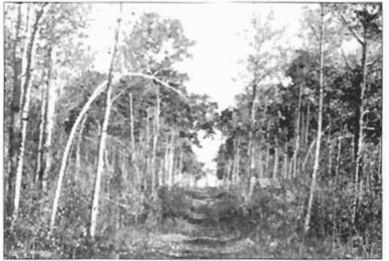
Central Avenue in the 1890's