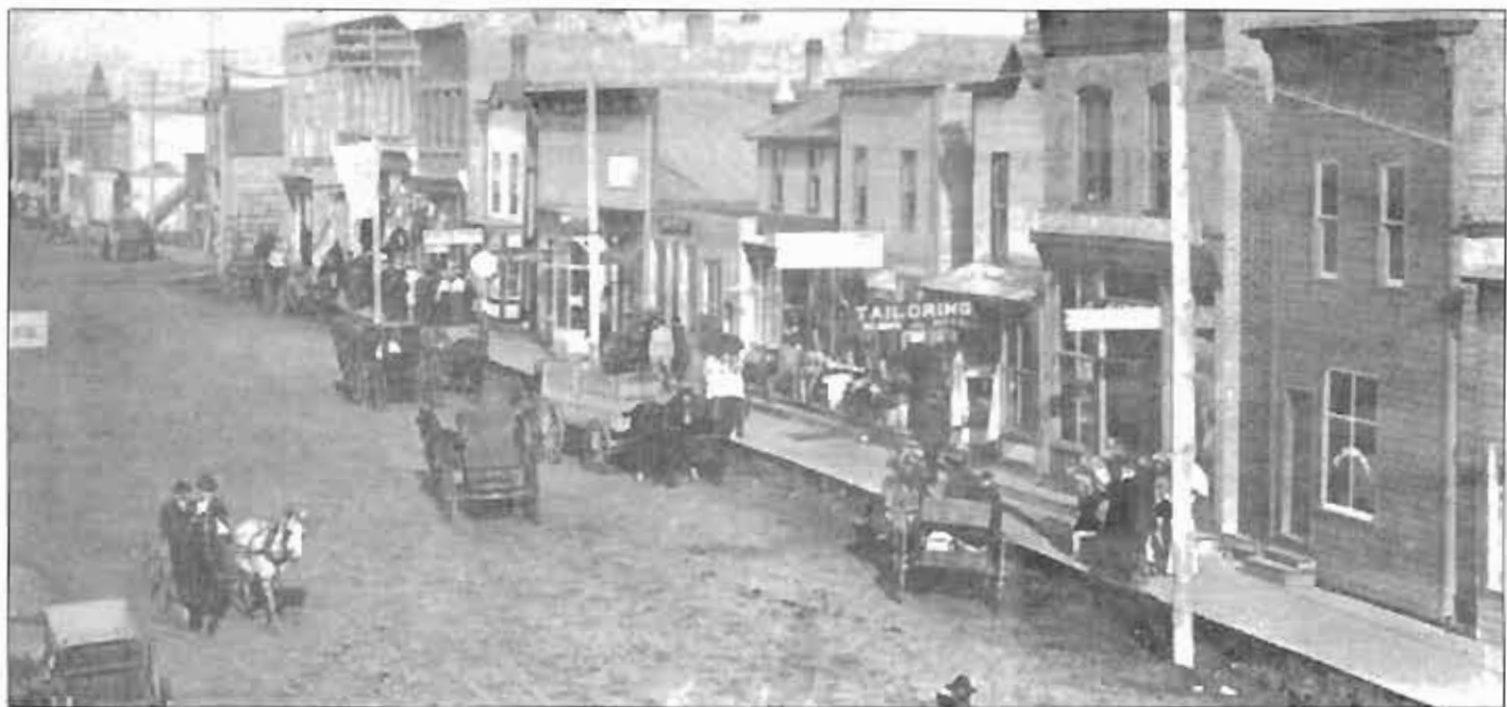
A busy afternoon on Main Street