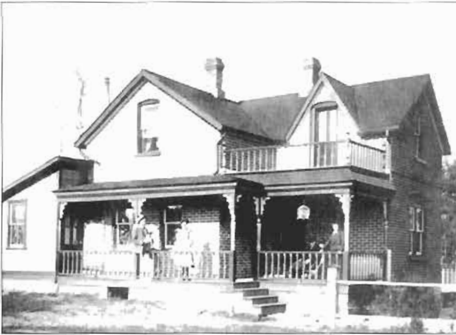
Home built with Innisfail brick