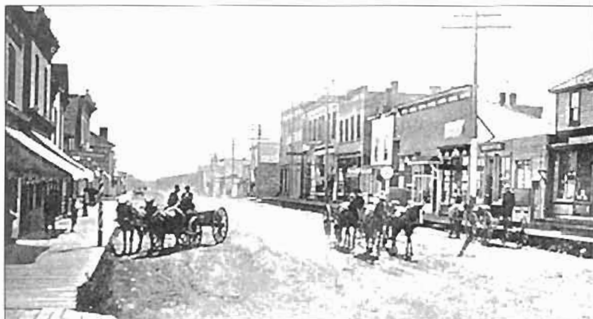
1909 Main Street as we look east