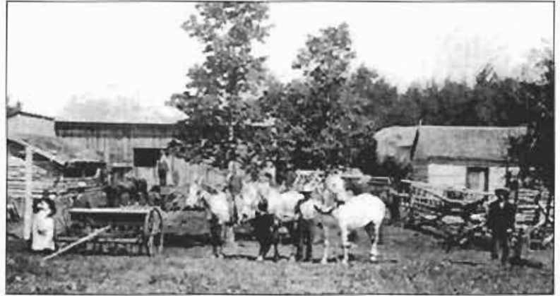
A pioneer farmstead

In the 1880s, Poplar Grove began as a collection of “shacks” along the Calgary-Edmonton Trail. With a growing interest in the agricultural potential around Poplar Grove, many more settlers began arriving. This became a flood of newcomers with the 1890-1891 construction of the railroad. By this time the Canadian Pacific Railroad had renamed Poplar Grove to Innisfail.