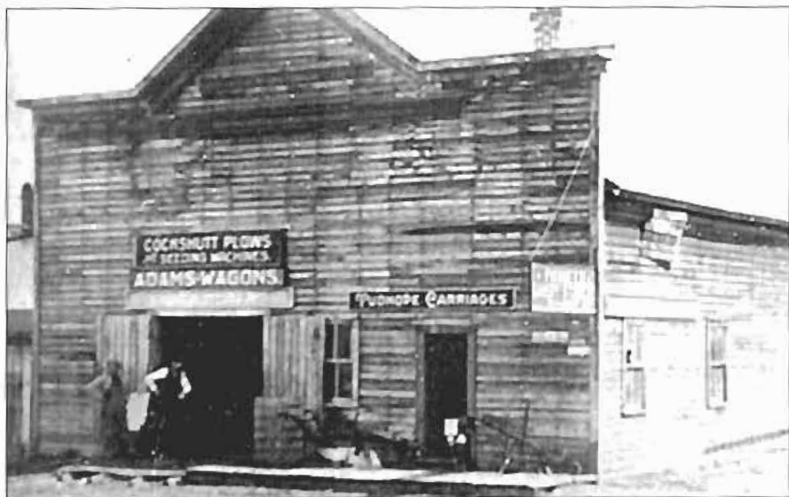
Bill Kemp's livery stable