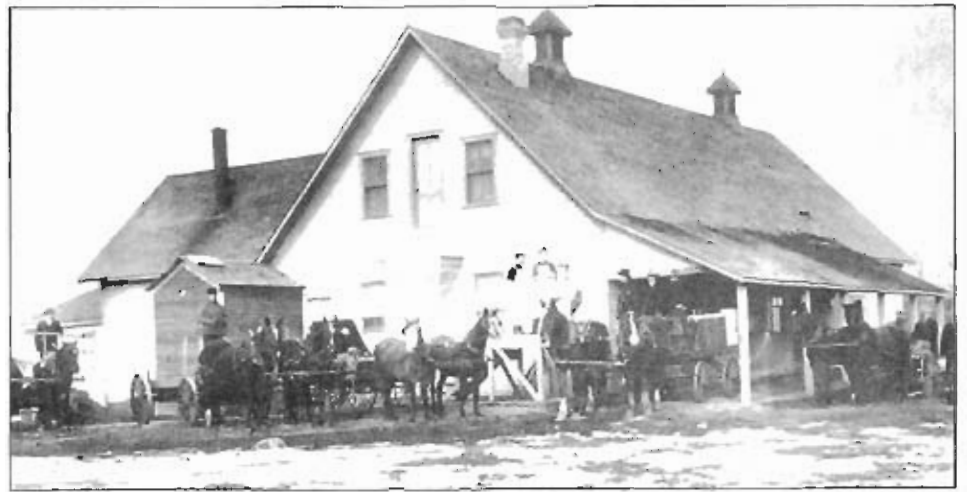
Innisfail's first creamery