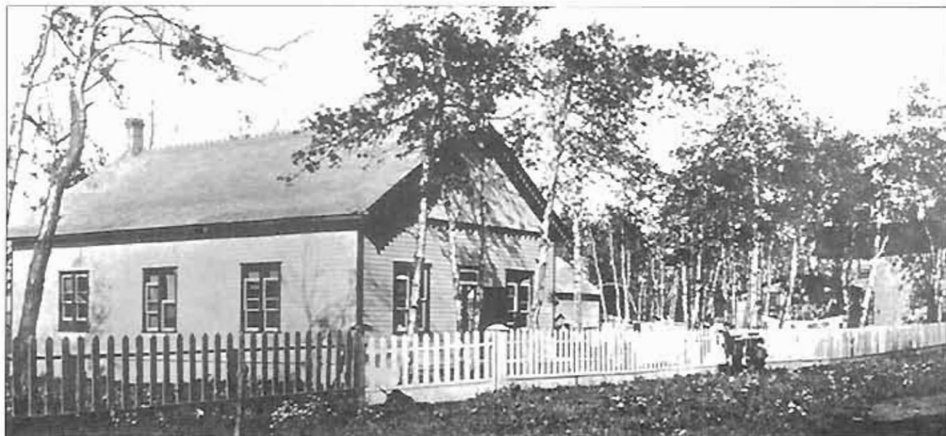
Innisfail's first school