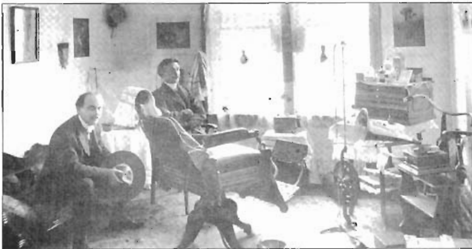
Innisfail's first dentist office