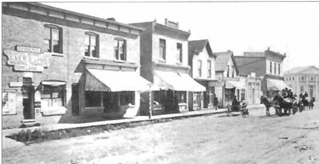
The north side of Main Street