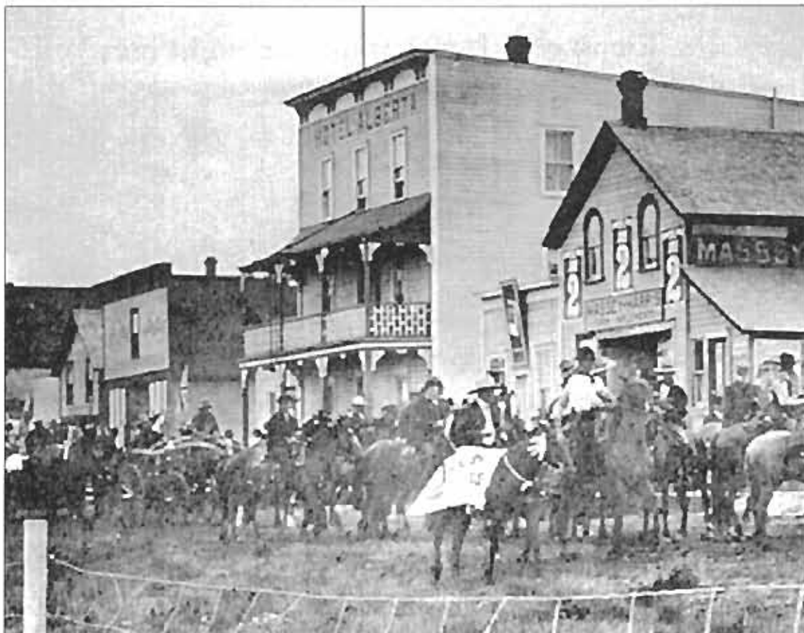
An 1880's July 1st parade. The Alberta Hotel faced the railway and would later be destroyed by fire.