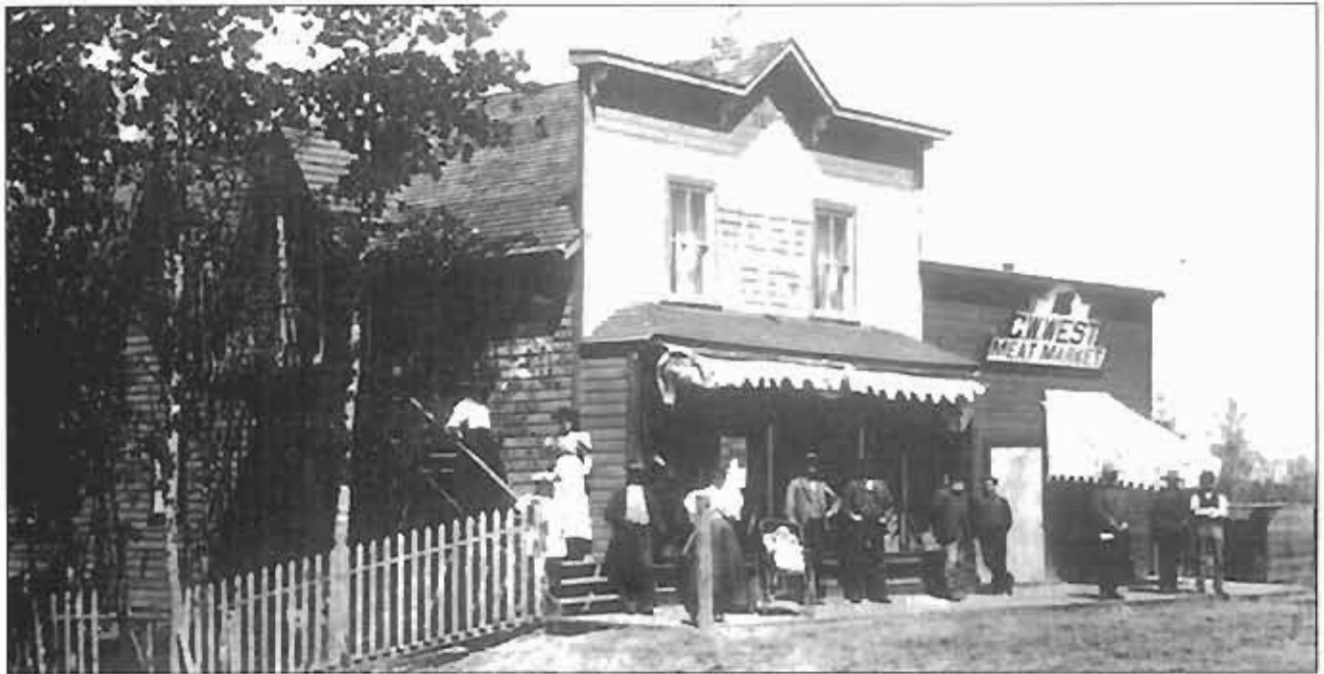
West's store in the 1890's

The first village storekeeper was G.W. West. This store served the general market needs of the people.