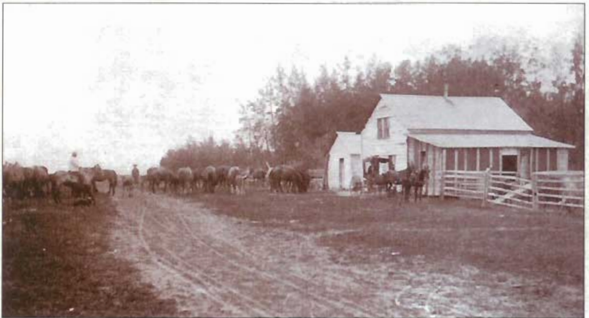
"Content's Stopping House" was located near Poplar Grove