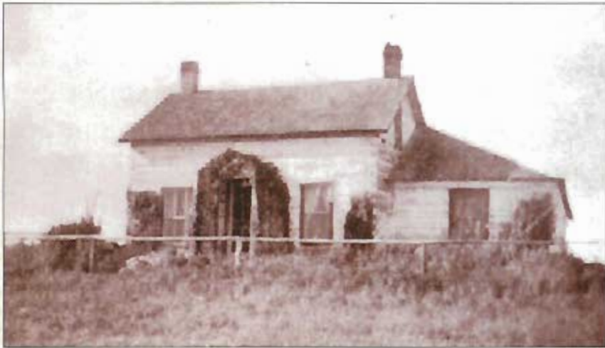
An early view of the "Spruces." Today the main part of the building is displayed in the Innisfail Historical Village and is the only stopping house from the original C&E trail remaining

What finally brought permanent settlement to this district was the building of the "stopping houses". Stretching north from Fort Calgary along the ancient Indian route called "Wolf's Track" and later called the Calgary-Edmonton Trail, were a series of "houses" that provided food and rest to area visitors. One of the first of these stopping houses was built in 1883-1884 just north of Innisfail's present location. This stopping house was built near a former Palliser Survey supply camp and became known as "The Spruces". In these early years, The Spruces provided temporary shelter for many area pioneers.